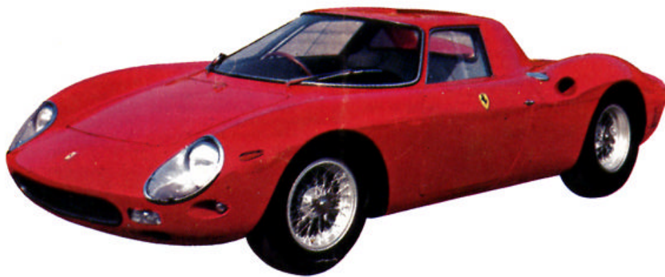
FERRARI Type 330P